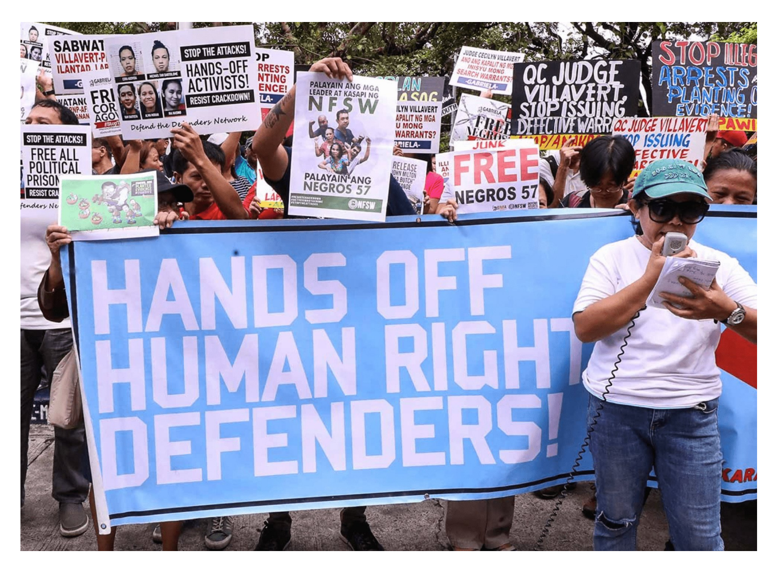
HANDS OFF. Human rights groups call for justice and protection in November 2019.

MANILA, Philippines – Night time signals different things to different people. It can mean the end of a long tiring day, with one's own bed as refuge from the chaos of work. But for many human rights workers, dusk triggers fear over what could happen given the rampant harassment they have endured over the